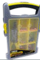
Tweco MIG Torch Consumable Organiser Box Part Number: W4012300